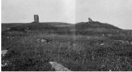
Crois Mhic Jamain

Mounds are archaeological sites of an accumulation of soil, sand, and middens often overlying hidden structures. Some mounds excavated on the Uists reveal Neolithic, Beaker, and Bronze Age pottery. These mounds have not been excavated.